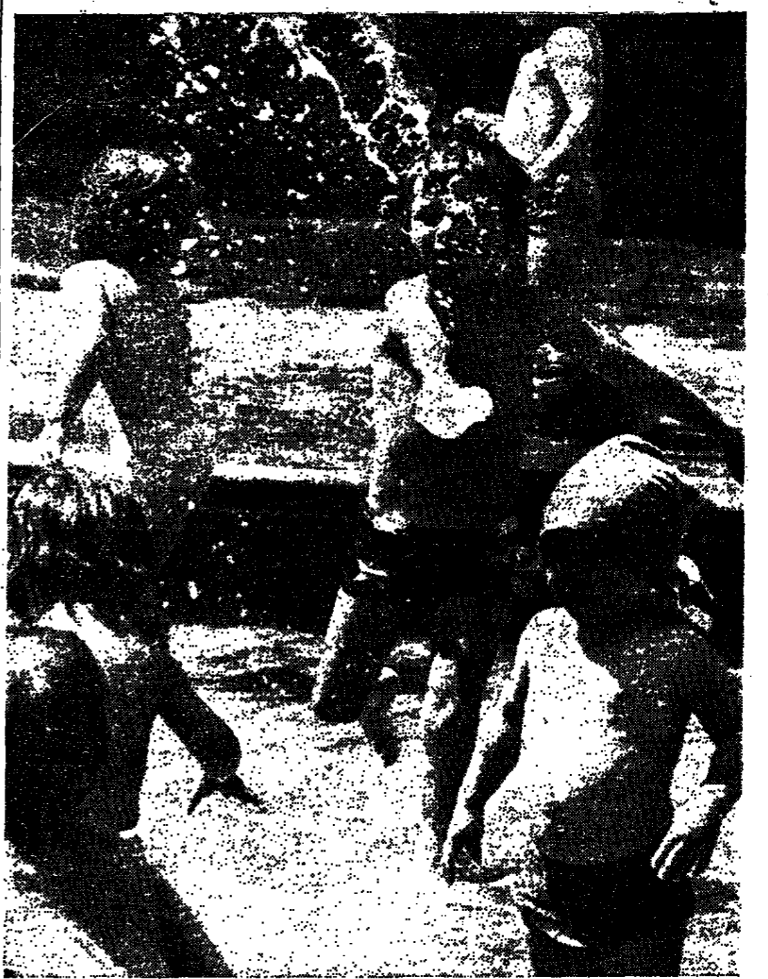
More sunshine: Water babies at the lido by the Serpentine in Hyde Park, London, yesterday. Temperatures at the weekend are expected to stay in the seventies, with plenty of sunshine. In west Wales council workmen have spread grit because of melting tar on roads. There is a chance of thundery showers in the extreme south late tomorrow, but the London Weather Centre said yesterday that the risk was slight. Forecasts and recordings, page 2

The rise was 1.4 per cent, bringing the total increase in the index since last October to 11.33 per cent. Threshold arrangements under Phase Three provide that workers who are covered receive up to 40p a week for every 1 per cent that the index rises above 6 per cent over last October's level. The April index brought the increase to 9.8 per cent, thereby triggering weekly rises of up to £1.20.